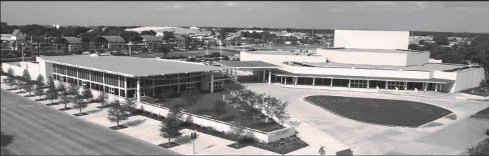
The Arts Center Brownlee Auditorium Seats 720