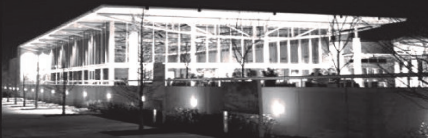
The Atrium Banquet Hall Seats up to 450 guests