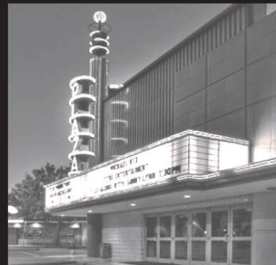
Plaza Theatre Seats 350