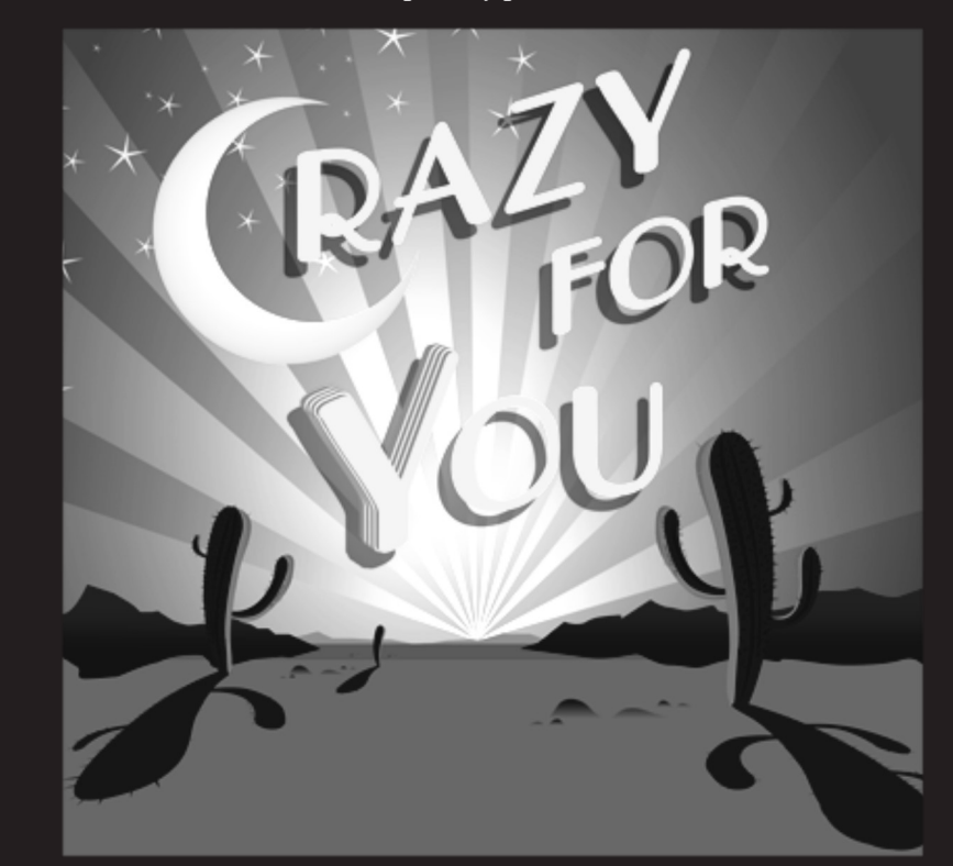
Granville Arts Center - Garland, Texas July 17-26, 2015

in partnership with Eastfield College proudly present